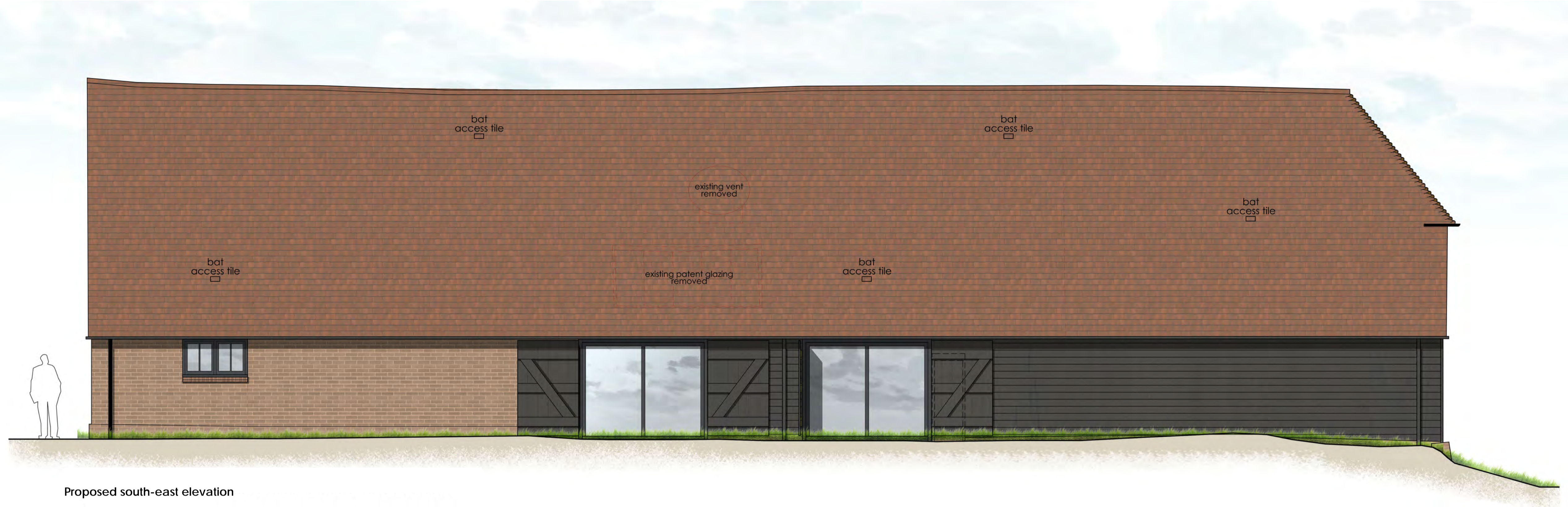
Proposed south-east elevation